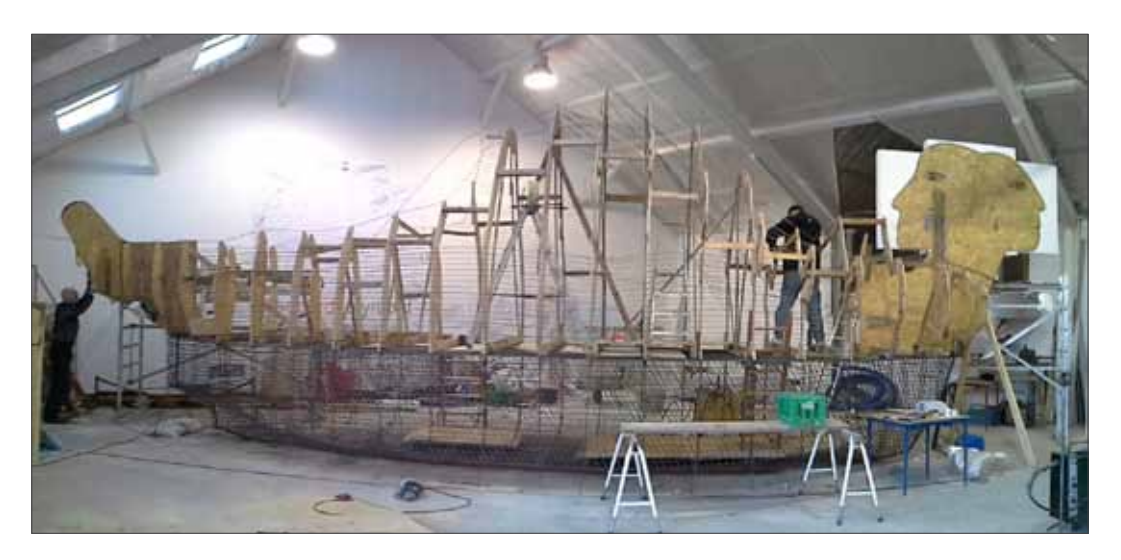
Figure 10. Production process in full scale of "My ship is loaded with Life".

"Life-Boats" can encompass an enormous amount whilst it is in the process of being realized. Communication is the key word. In my view, it would be natural to attach songs to the boats. The boats will cross borders and create contacts and it is thus important and natural that they will be filled with many different kinds of artistic expression. Songs are one of the best shortcuts to creating an understanding of each others' cultures, which is what the boats meant to do."