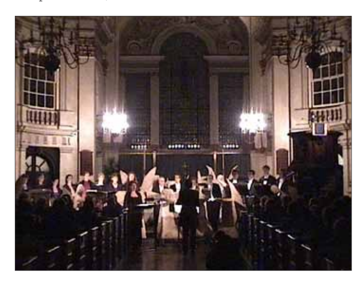
Figure 1. "Rolling Angels" with Norwegian Soloist's Choir; singing Geir Johnson's composition "Rolling Angels" in the Church of St. Martin in The Fields, Trafalgar Square, London, 2000.