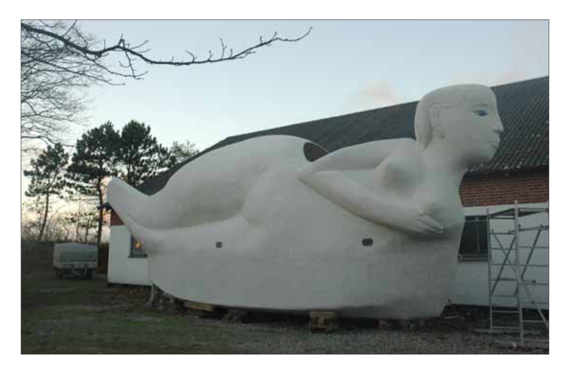
Figure 12. "My Ship is Loaded with Longing" The first sculptural ship is ready and stored outside of my studio, until it will be sailing together with the other two sculptural ships.

The outcome that I am hoping for, with the "Life-Boats" project, is that people will see that irrational and at the outset mad visions can be realized. That belief can move mountains. That one can embark on unknown journeys in and outside of oneself and create a foundation of value in the service of culture, which creates opportunities for lifting and carrying together.