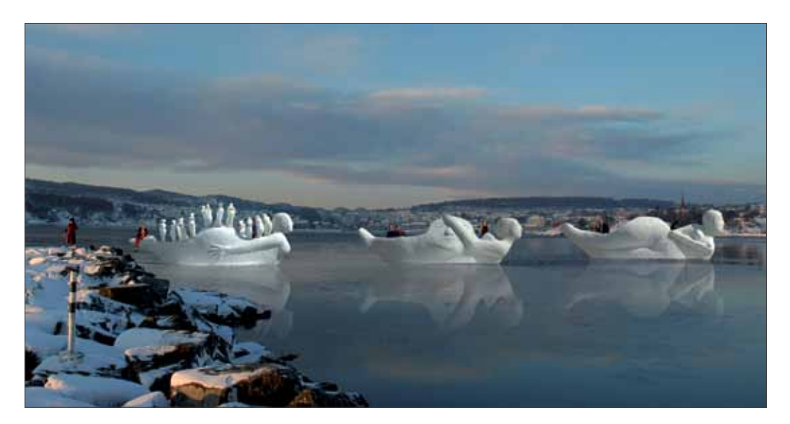
Figure 7. Life-Boats - An artistic rendering of the sculptures sailing in the Larvik Fjord in Norway by C. Orntoft and Malene Pedersen.

3m over the surface of the water. The sailing figures will be propelled forward by electrical motors which will be charged with alternative energy.