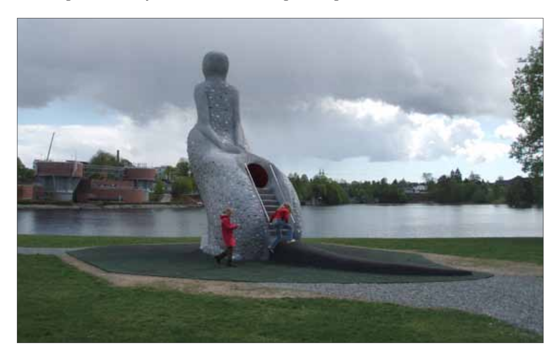
Figure 5. "The Rat Maiden" Skien, 2006, cement, 7 meters tall. Made for the 100 year jubilee of Henrik Ibsen.

"The Lady of the Sea" - is an example of how a monumental sculpture can create a whole new town space; provide a location with an eye catching new profile and the town a striking landmark. With The Lady of the Sea, Marit Benthe Norheim has succeeded in combining writing and sculpture, religion and art, children and art, together in a way that is both fascinating and original."