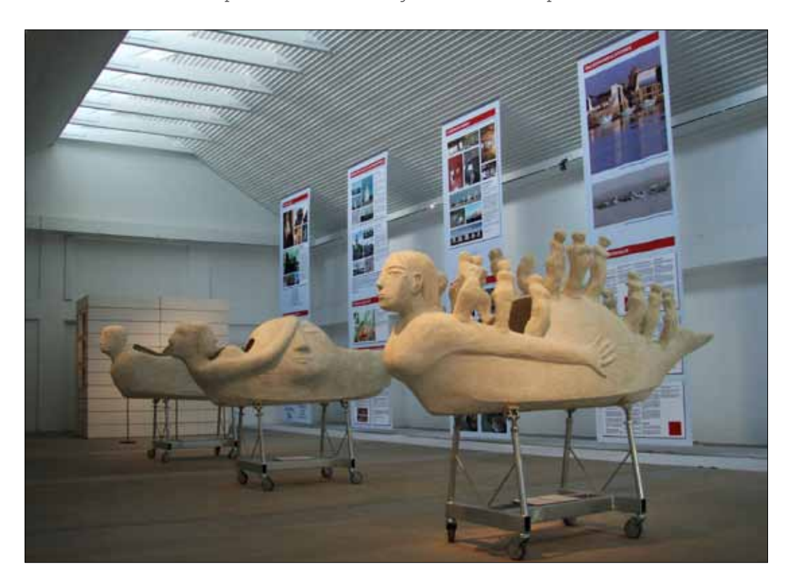
Figure 9. All three models 1:5 from an exhibition in Skagen, Denmark.

different reasons. We will include interviews with refugee women and immigrant women from as many different cultures as possible – living in the participating countries. The interviews will be about belonging and identification and will be made available to the public audio visually inside the sculpture.