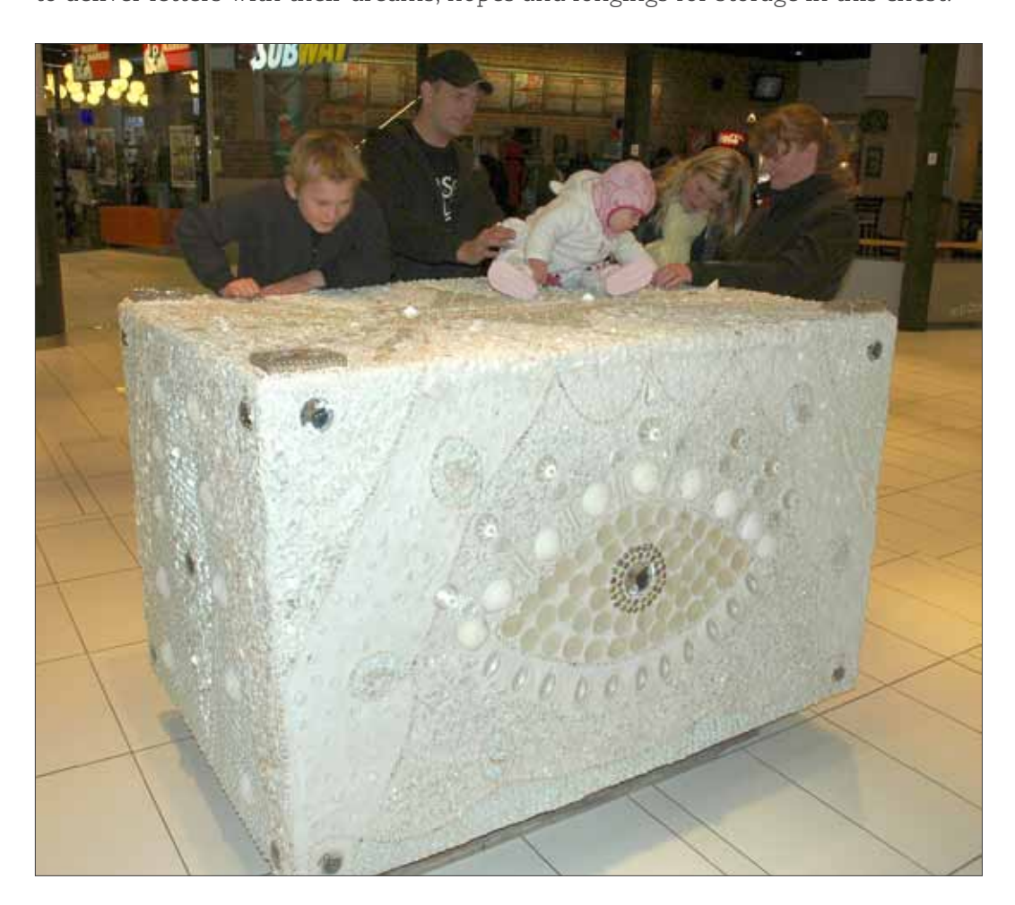
Figure 8. The full scale chest in the shopping center Friis, Aalborg.

"My Ship is Loaded with Longing" the young one, entering the world, whilst offering her breast. She lies on her side, with her hips as the cabin. She will have a treasure chest inside her body. The treasure chest is decorated with true pearls and prisms, with a letter opening, so that the people we meet will have a chance to deliver letters with their dreams, hopes and longings for storage in this chest.