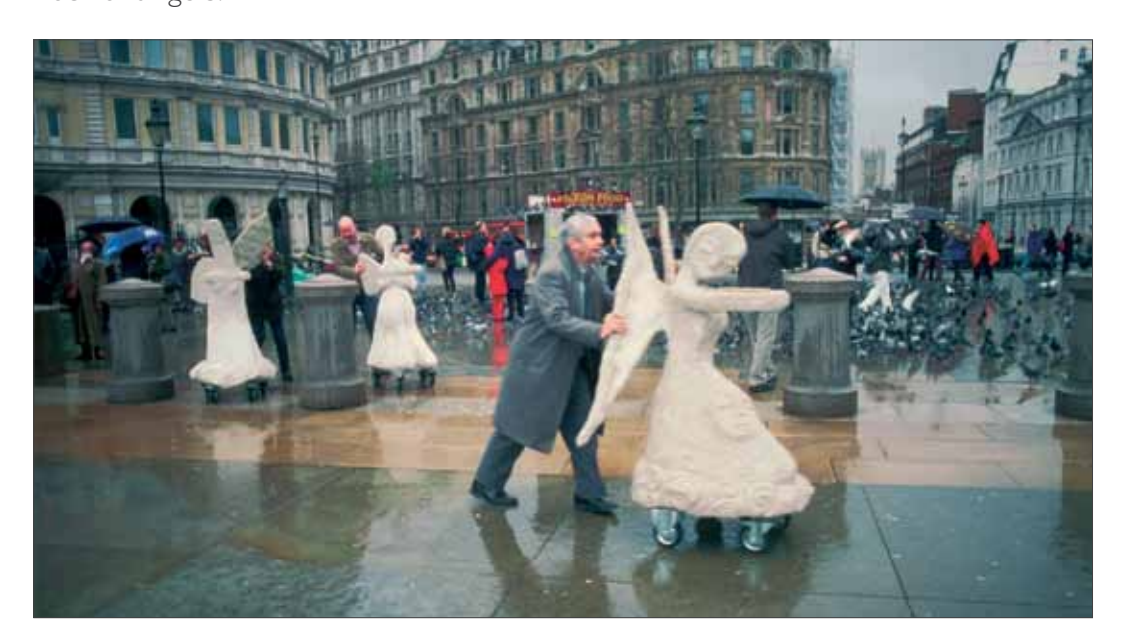
Figure 2. A "Rolling Angel" pushed by a man in Trafalgar Square, London 2000.

make a work that is as adaptable as this one, where audience participation and involvement have been crucial for being able to use them in the public space. They have been pulled and pushed through the towns by both young and old. These journeys have also demonstrated the relationship that three different cultures have to angels as symbols, and the reactions to the angel sculptures' effect on the public life. In Norway, most of the focus was placed on the sculptures as a missionary tool and the prejudices surrounding this. Both in the UK and in Denmark the curiosity was directed to a greater degree towards the connection between the spiritual aspect and culture, both in terms of content and historically. The angels staged confrontational and challenging situations by their mere presence. The character of the surroundings was changed by the arrival of this large flock of angels.