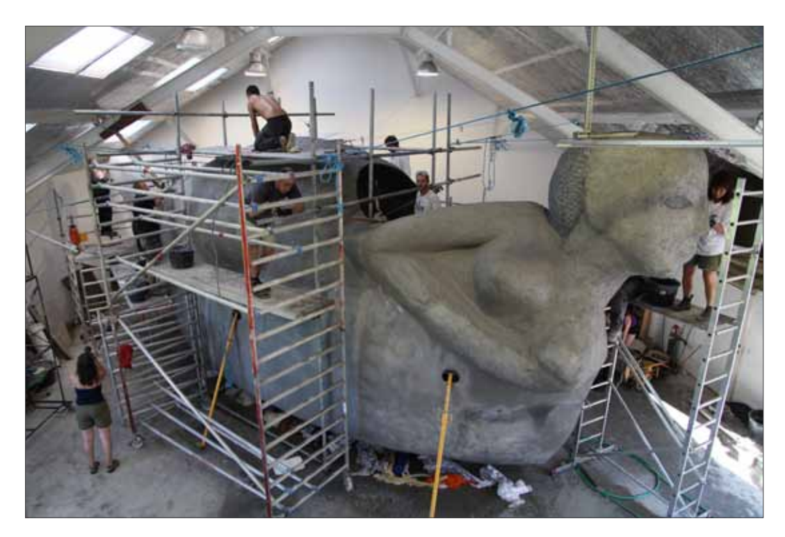
Figure 11. The casting process of "My ship is loaded with Longing"

During a weekend in May 2012, more than 80 volunteers participated in the casting of the first boat. This was a very powerful event of working together to achieve a clear and specific task, by people from the age of 15 - 75, and from a huge variety of social backgrounds.