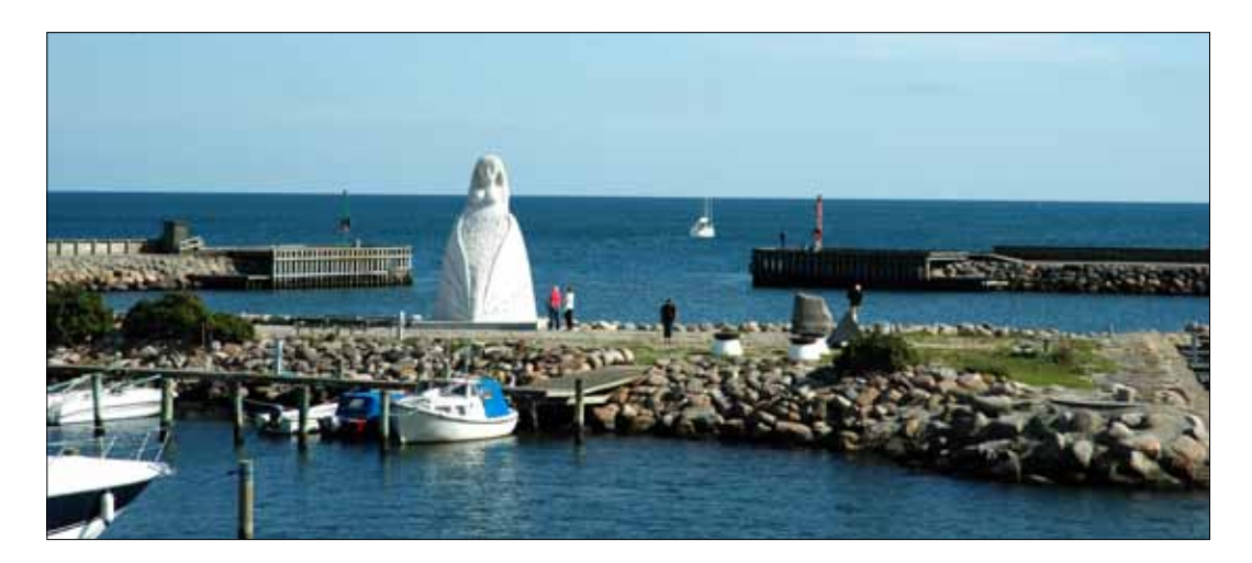
Figure 4. "Lady of the Sea" at Saeby harbor, DK, in collaboration with 905 children.