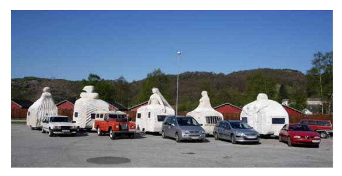
Figure 6. "Camping Women" – A rolling installation in concrete made for Stavanger – the 2008 European Capital of Culture.

"Camping Women" (Was made in relation to the European Capital of Culture designation for Stavanger in 2008). The bearing idea and simultaneously the inner armature of the construction of the concrete sculptures are functioning caravans. Each of the female sculptures' torsos grows out of the roof, such that the caravan functions as the skirt of the figure. One can enter the 4 meters tall "Camping Women" which are titled; the Refugee, the Bride, Maria the Protector, Sirene and Camping mama. Inside, the space has been customized in various ways - several of them with the participation of different population groups.